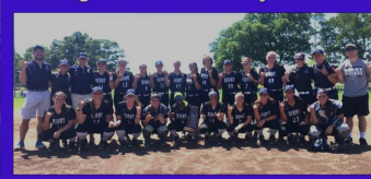
SAA Champions! NCAA Tourney / 36-6 record